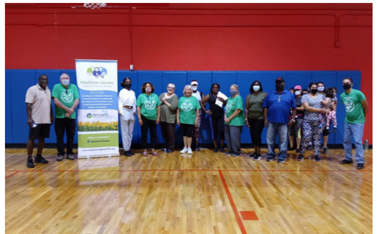
Woosa Self Care Retreat