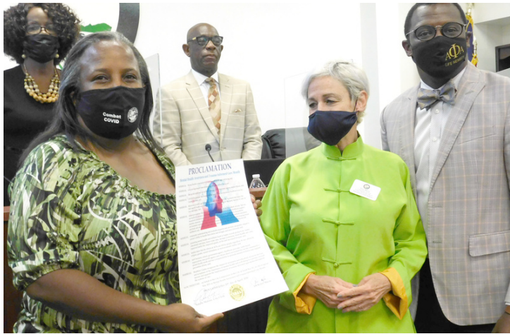
Receiving City Proclamations