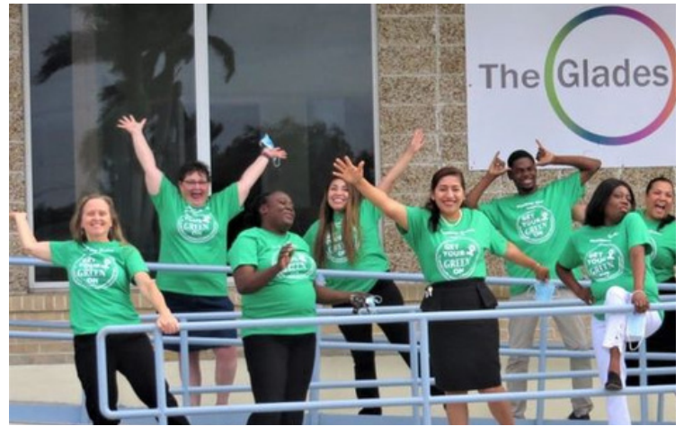
Get Your Green On Day