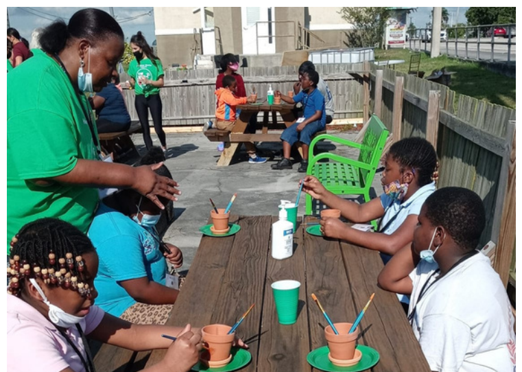
Soil to Soul Gardening and Paint Party

Healthier Glades partnered with community leaders and residents to bring awareness about mental health and how it impacts the way our communities live, work and play. The community rose to the occasion and made sure that our residents understand the importance of self care.