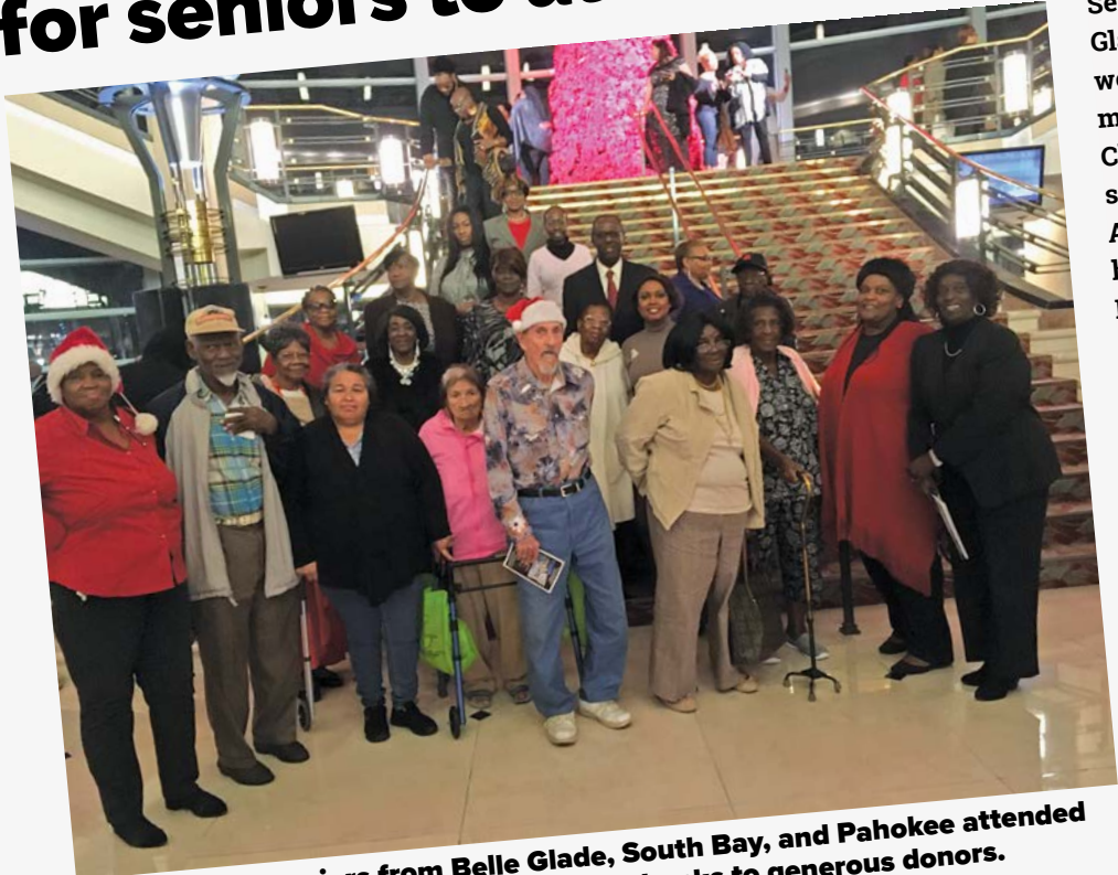
More than 40 seniors from Belle Glade, South Bay, and Pahokee attended the "Gospel According to Jazz" concert, thanks to generous donors.