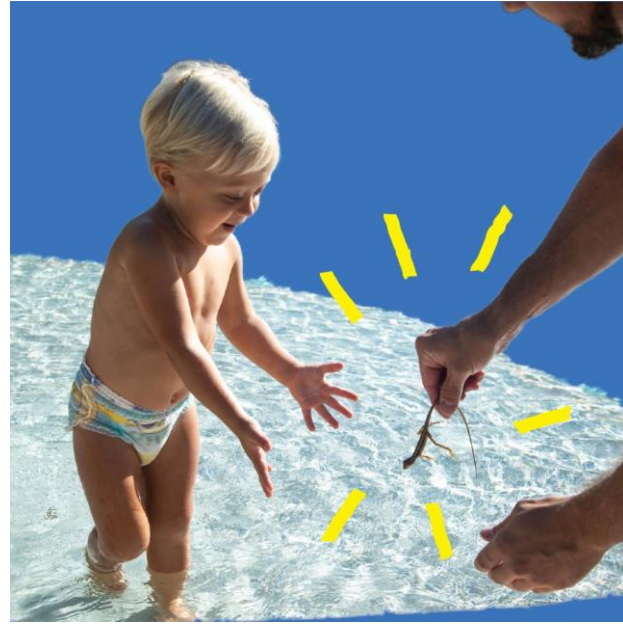
It's a beautiful day in the neighborhood to explore nature

Please note: To access the complete article, please sign up to create your FREE EveryParent account! Items above may change with COVID-19 updates in Palm Beach County.