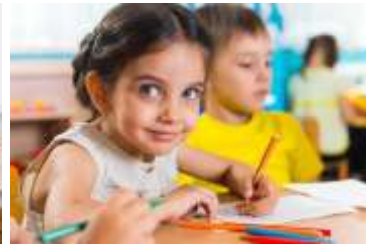
Who Is Eligible?