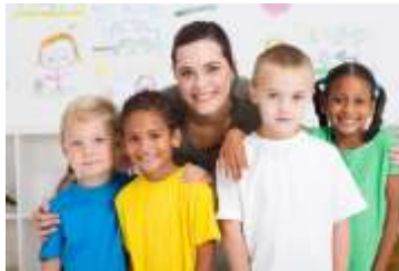
Why VPK Matters