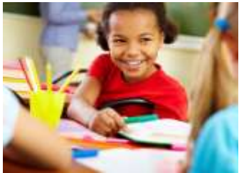
What Is VPK

You can apply for the VPK certificate online, if you haven't already! Once you have it, you can take that to any VPK provider in Palm Beach County. Contact us at 561.514.3300 for specific providers based on you and your family's unique needs. It's not too late to take advantage of this free program, some providers even have classes starting soon!