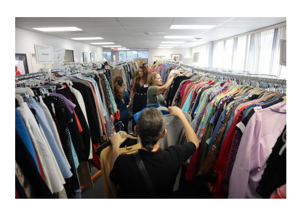
3 days...300+ shoppers...$40,000+ raised